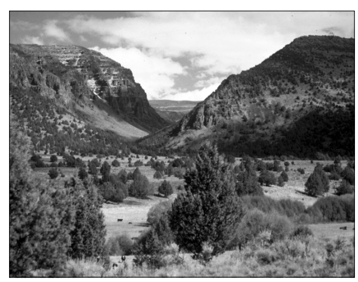
Western juniper woodland, in mid succession, encroaching into a mountain big sagebrush community on Steens Mountain.

juniper berries provide an important source of energy, containing 46% carbohydrate and 16% fat. Birds eat and disperse the seeds. Rabbits, coyotes, and many small mammals also eat the juniper berries, spreading the seed across the landscape.